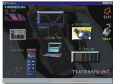
Main Control Window