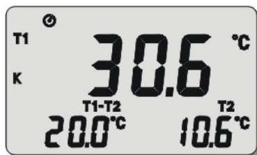
Triple Display (305/306)